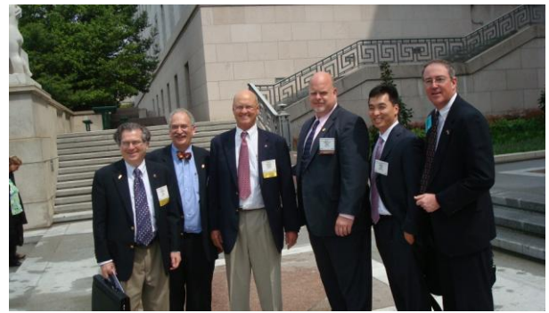
NCOA delegation on the Hill