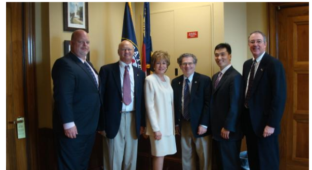
NCOA visits with Senator Elizabeth Dole