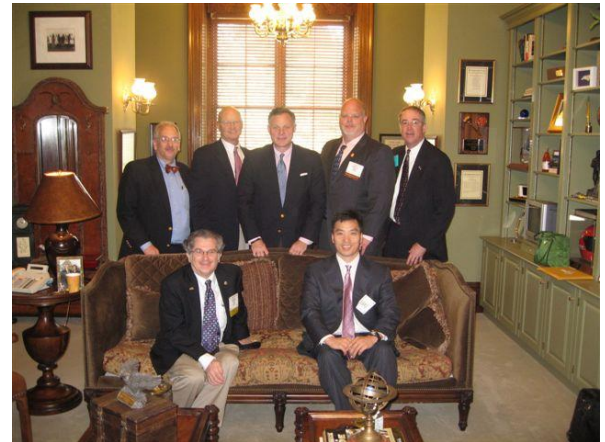
NCOA Delegation visits with Senator Richard Burr